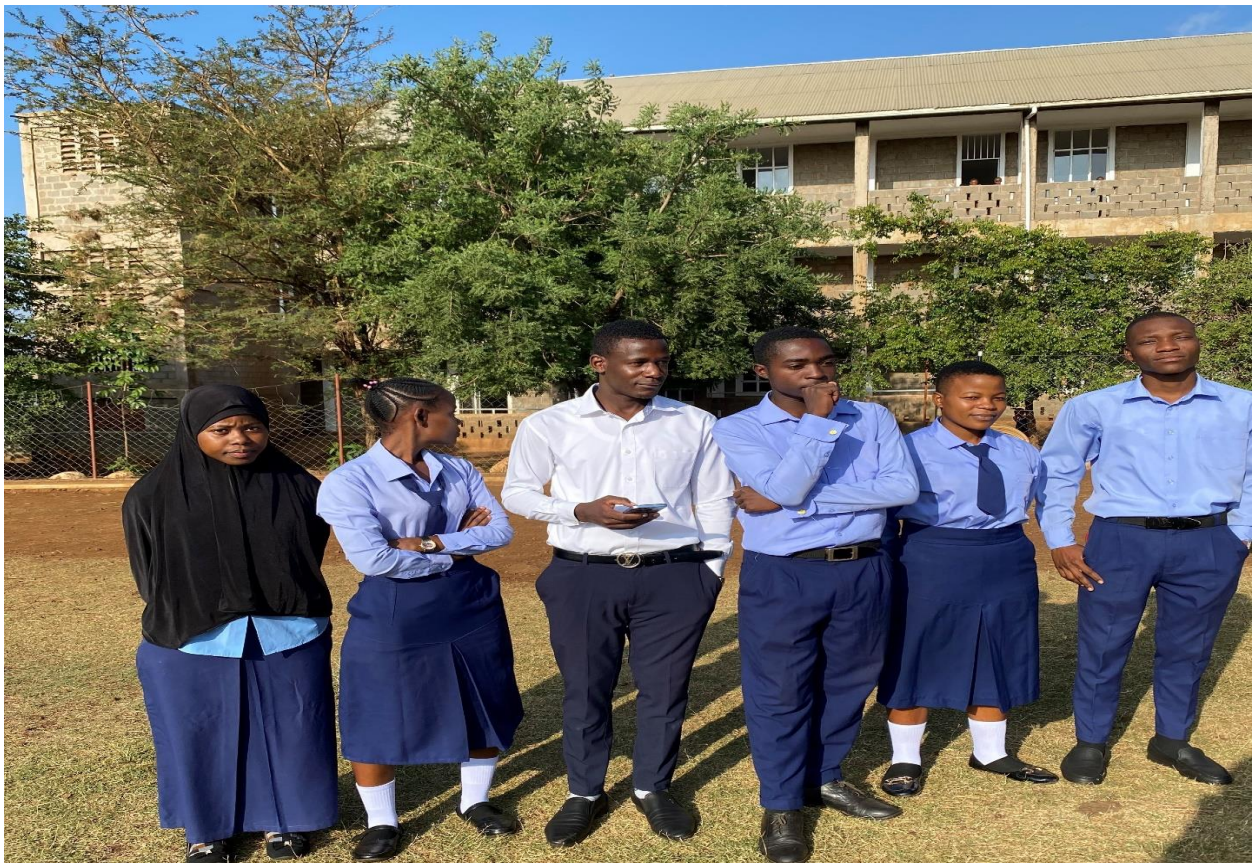
Field teachers from Marangu teacher's college

The Government of Tanzania has given us 8 field Teachers from Marangu Teachers College. They reported on 03/02/2025 they will stay for two months, so by 03/04/2025 they will go back to their College.