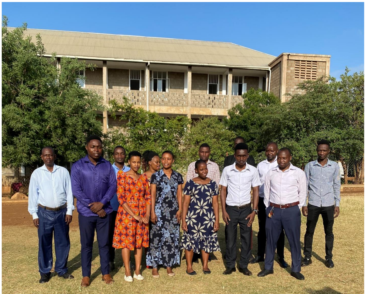
Some of the Bright Teachers