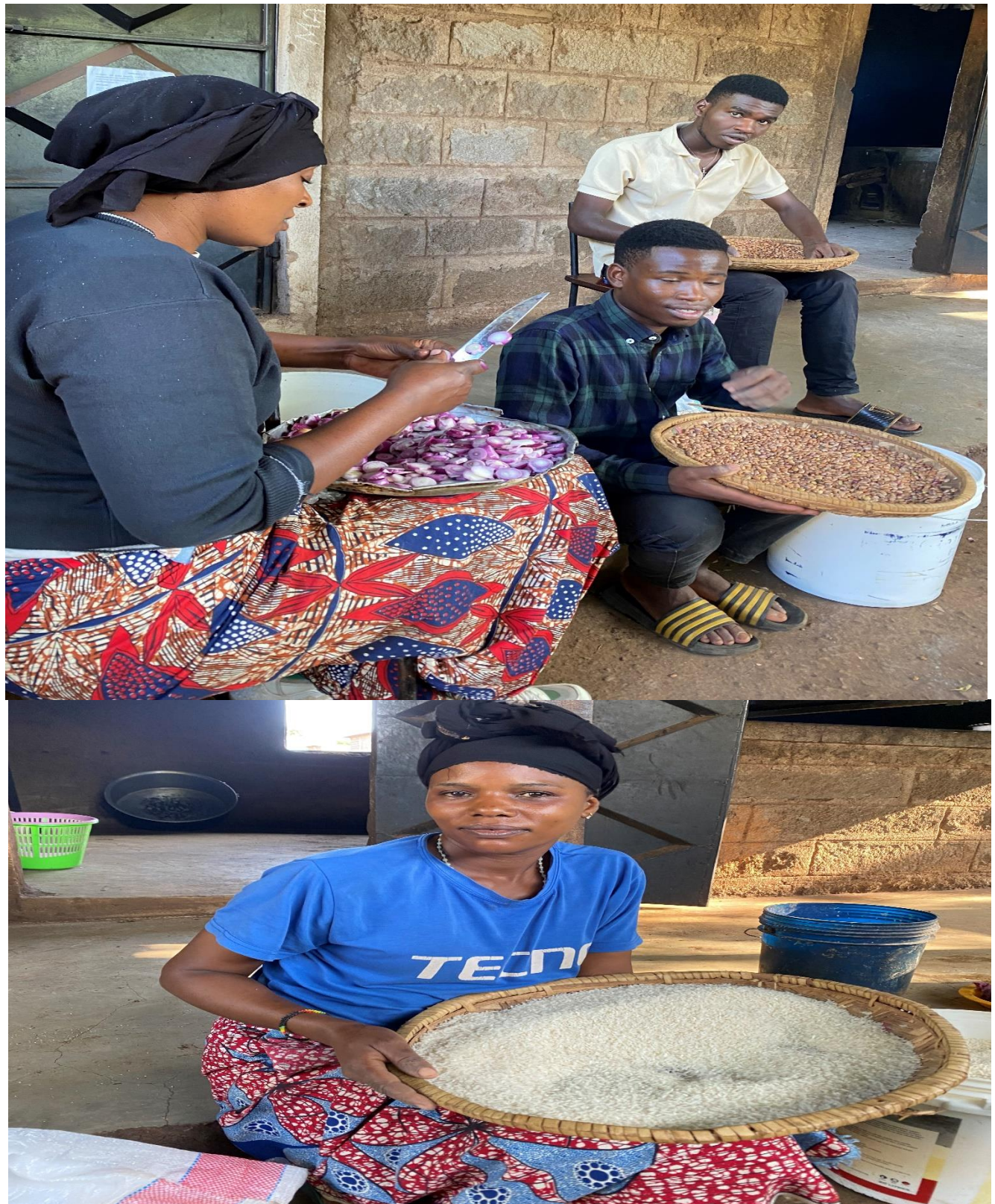
Bright school cooks