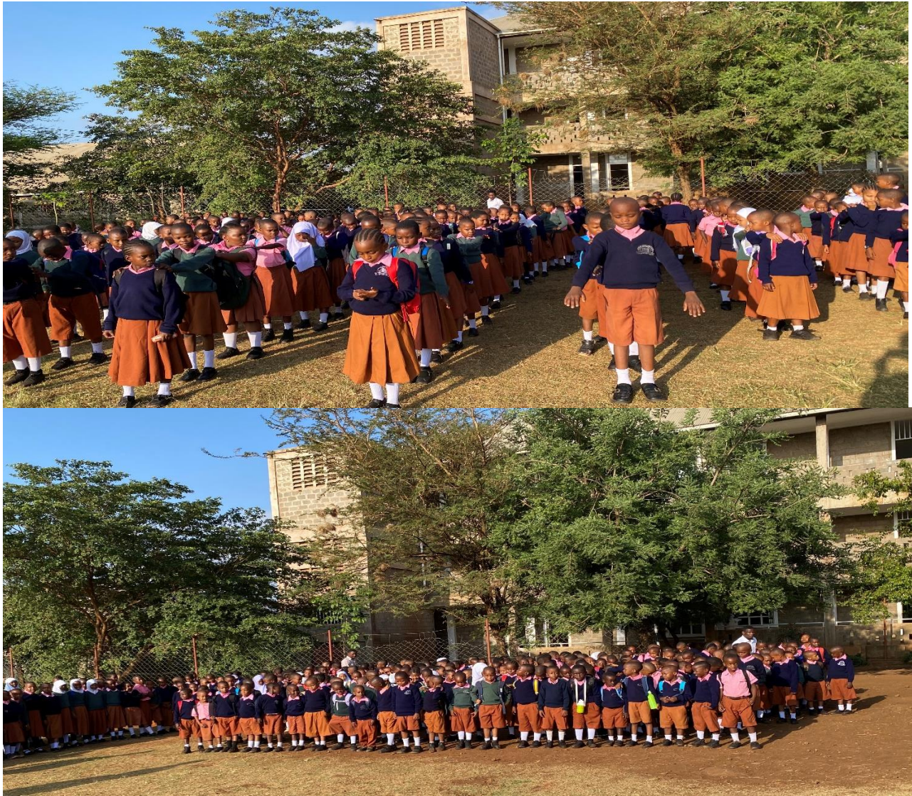
Bright pupils at assembly ground

Finally, we have photos of all pupils of Bright school, Teachers, Drivers, Cooks and cleaners