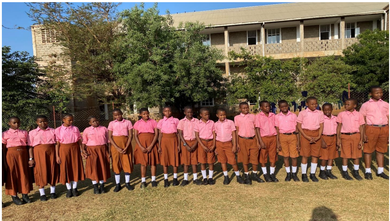
Standard seven pupils 2025

We would like to appreciate for supporting us with computers. We are in the process of installing them. Actually, the new curriculum needs a lot from the computer technology they will really help us towards achieving this. Once's the installation is over we will let you know. Below are pictures showing how far have we gone towards this project.