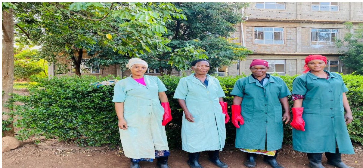
Bright school cleaners