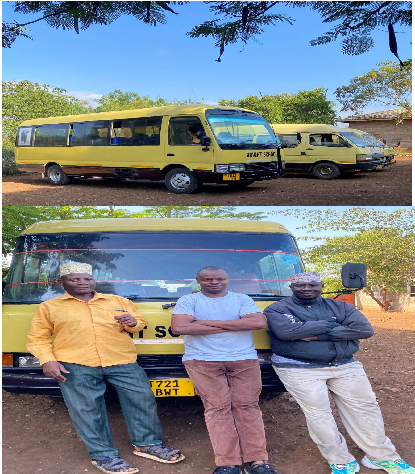
Some of the school drivers and school buses